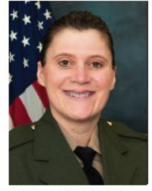
Chief of Staff Office of the Director